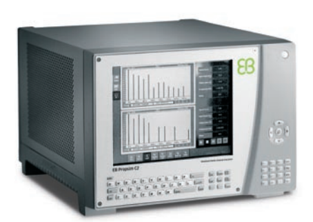
EB Propsim C2