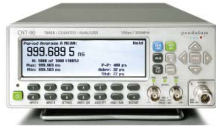
Figure 4: Display showing different statistical parameters viewed at the same time.