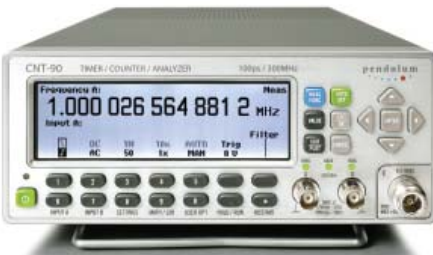
Figure 3: Input parameter setting menu shown with measured result.