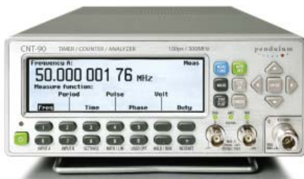
Figure 2: Measure function selection menu, shown with measured results.