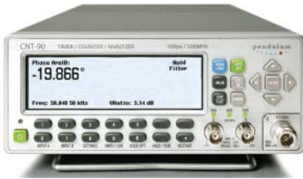
Figure 1: Display showing phase value, frequency, attenuation Va/Vb, and auxiliary parameters.

When adjusting a frequency source to given limits, the graphic display gives fast and accurate visual calibration guidance.