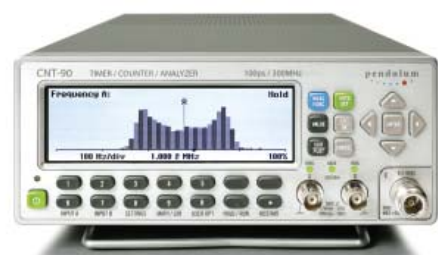
Figure 6: The same result as in Figure 5, now displayed as a histogram.