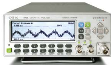
Figure 5: Display showing the trend (signal over time) of sampled data.