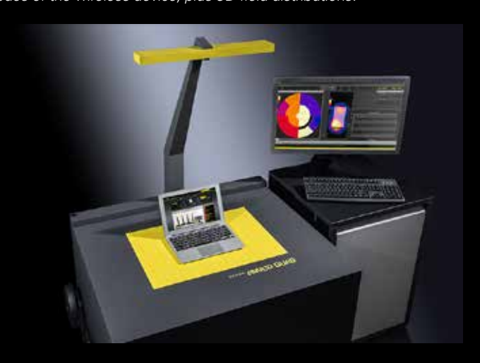
cSAR3D Quad is ideal for measurement of large devices such as laptops and pico base stations.